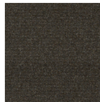
389-5690 Gun Metal*